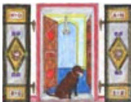
Picture Traced From a Book & Painted Over