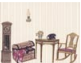
Paper & Stickers from a Scrapbook Store