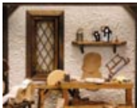
Photo of Grandma's Dollhouse