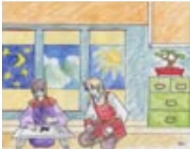
Crayons & Coloring Book