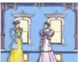
Paperdolls / Collage