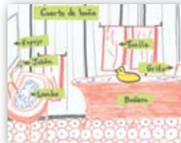
(labels applied over drawing)

Teach diversity, world cultures & holidays