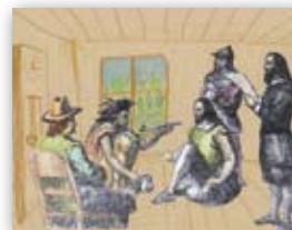
(mixed media collage)

Provide a focal point for creative writing projects