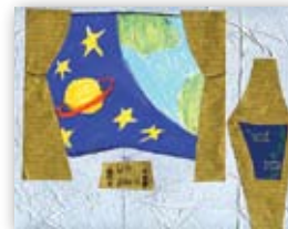
(mixed media collage)

Inspire wildly imaginative problem solving