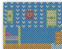
(ink-jet computer printout)

Challenge students to use symbolic representation