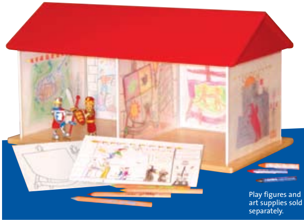
“Family History Coats of Arms” and “Tapestry Book Reports” (student drawings over photocopied templates)

ArtHouse is the toy building with storyboard walls: Students create characters and settings on paper, often with captions or labels, and bring them together in easily-presented dioramas. Perfect for project based learning across curriculum and at all grade levels! Storyboard dioramas build planning, storytelling, presentation, and higher level thinking skills.