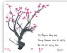
(india ink and tissue paper)

Provide a focal point for creative writing projects