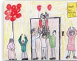
(pen and crayons)

Enhance understanding & appreciation of art